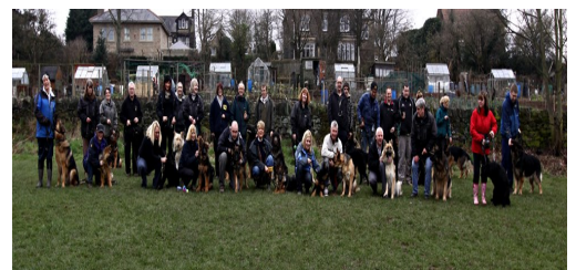
To find out more about the club you can visit their website at www.leedsbagsd.com