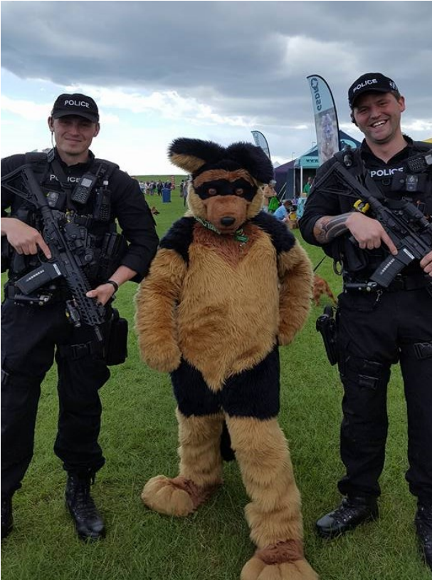
Shep's got friends in the force