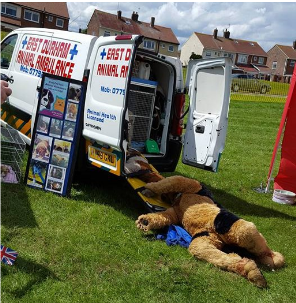
Visiting the animal ambulance—don't ask!