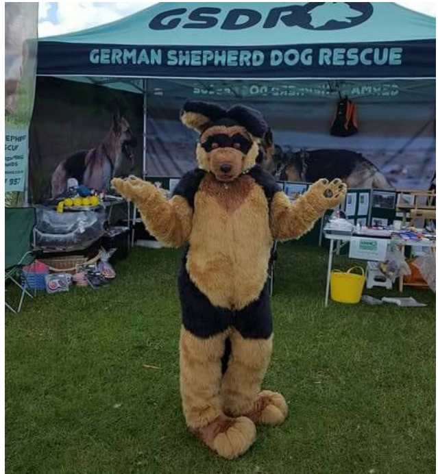
See you next year Shep!