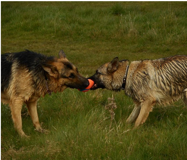
Learning how to play