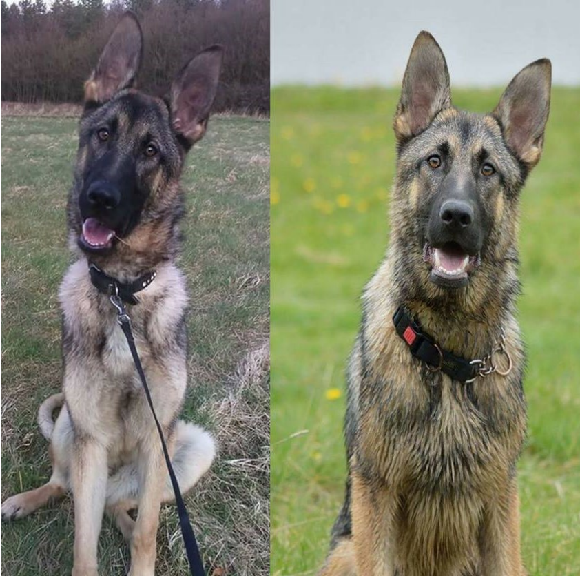
Lady when she first arrived in foster (left) and 5 weeks later