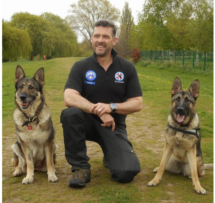
They hit it off!