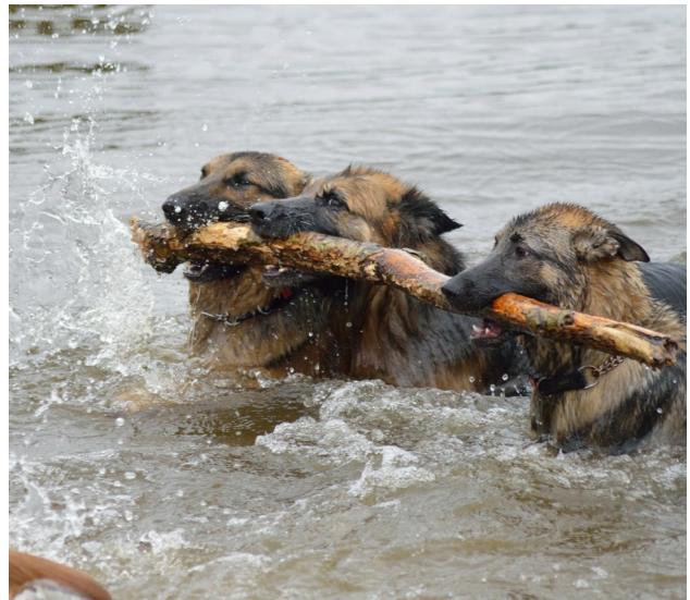
Lady learnt how to swim