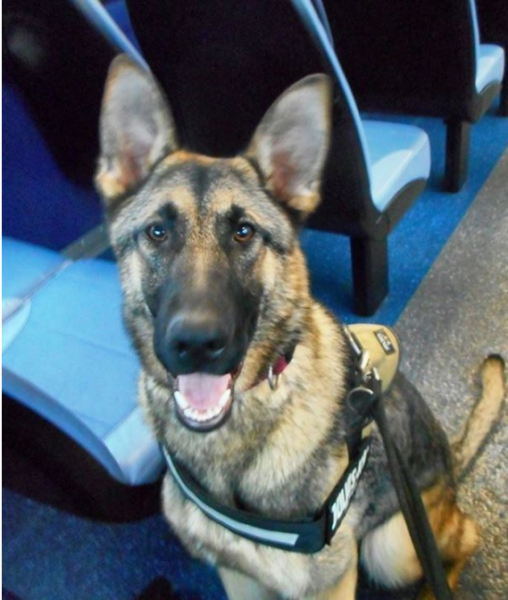
And then the day came and off she went on the train to meet her new family.....