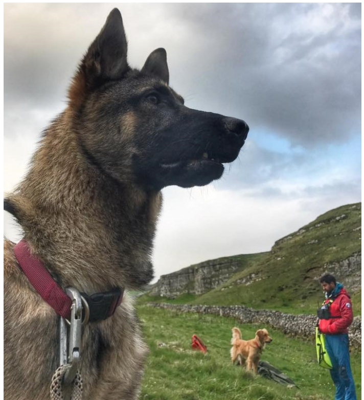
And she's loving it!

From a bleak future to a fantastic career, it couldn't have happened without those gorgeous boys that are Rocky, Ben and Shorty Shep Paddy. With a little help from their Mam of course.