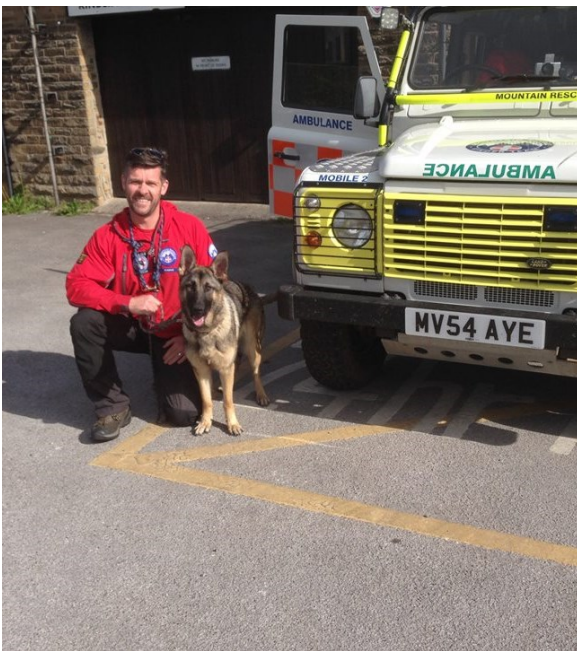
She's got lot to learn