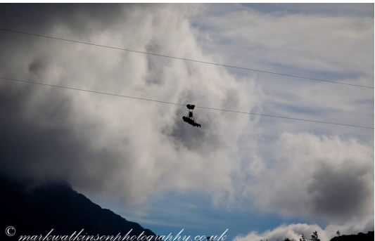
It looks a bit lonely up there ....