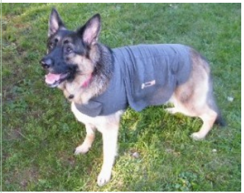
Thundershirts can have a calming affect on anxious dogs.