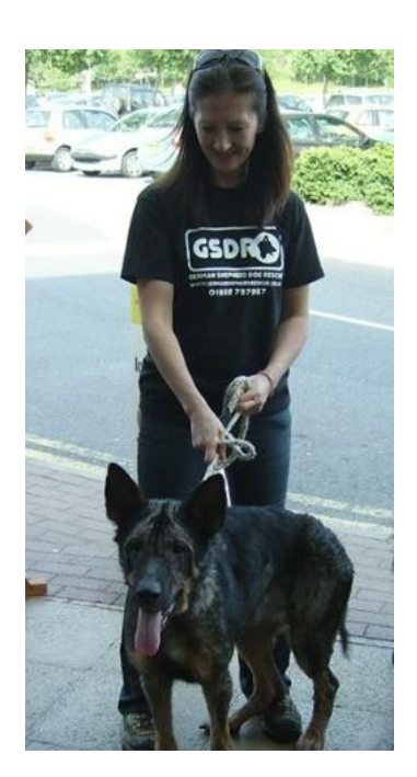
Hope popped into Pets at Home to support Team Fat Blokes

Here is Hope today going for a nice walk after having another medicated bath. Isn't she looking good! Her skin is less thickened and her hair is starting to grow back. She is still undergoing treatment for her Demodectic Mange which turns out to be the juvenile form because believe it or not but under that thickened skin and wrinkles is a girl of only 12 - 18 months old according to the vet. She has very loose skin underneath her abdomen which is either due to weight loss or the possibility that she may have had pups, the stress of which could have been the trigger for the episode of Mange. One thing is for certain though, the amount of thickening she has, especially to her elbows, has built up over a period of time and she was left untreated by whoever 'owned' her.