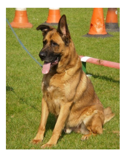
Poor Chopper has been in kennels for around TWO years. There must be a home for this loveable chunky monkey out there somewhere. Chopper is currently in Kent.