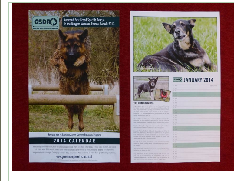
Get your GSDR 2014 Calendar NOW!