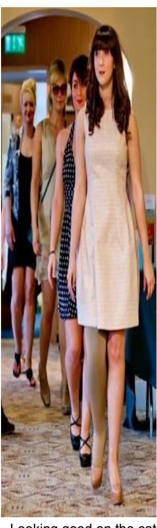
Looking good on the cat walk