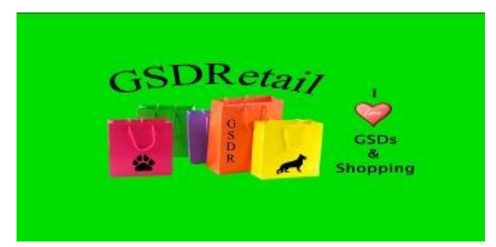
Keep an eye on our website for a new and exciting range of merchandise coming soon!