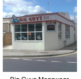
Big Guys Menswear