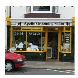
Apollo Dog Groomers