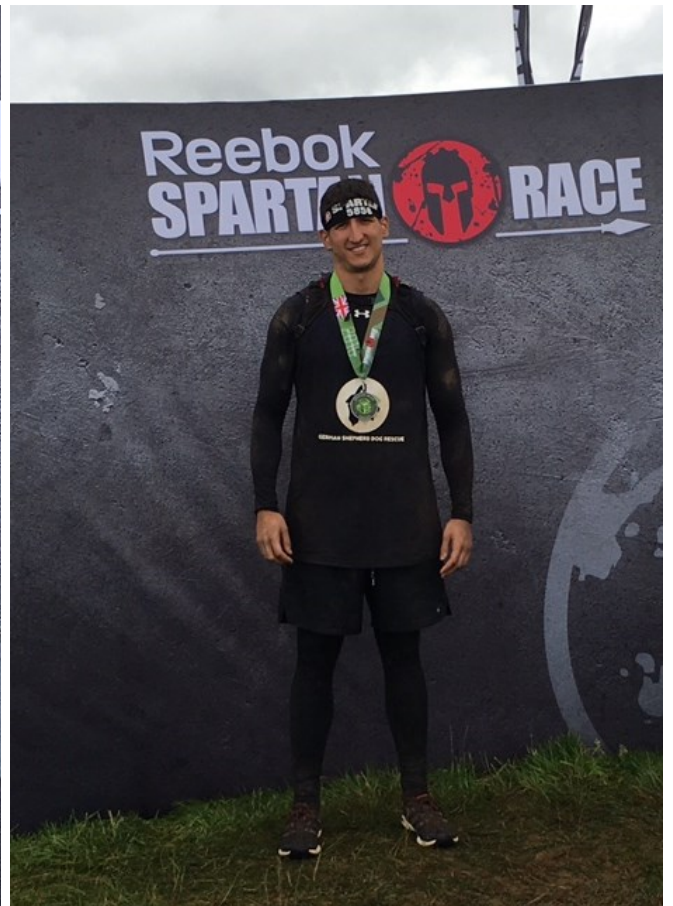
Tired, muddy but still smiling