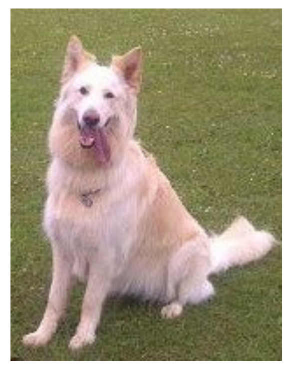
Now known as Princess Cici, this lovely girl is very happy with her new mum & dad