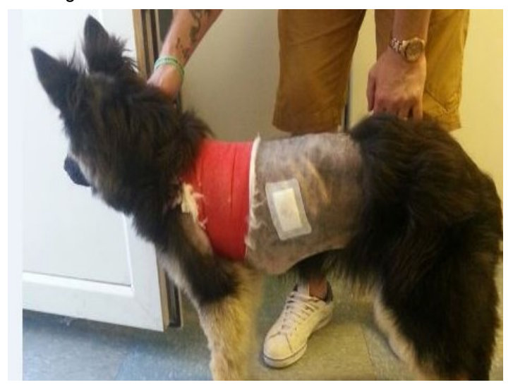
Discharged from hospital and back at home